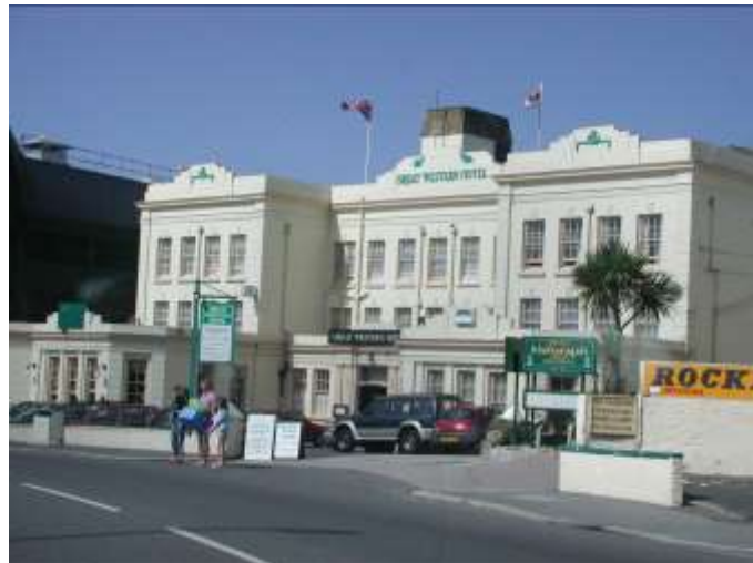
A grand hotel