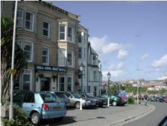
A seafront hotel