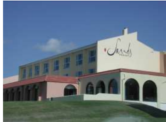
A modern hotel